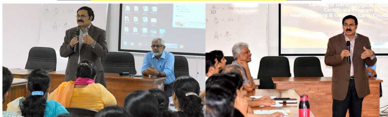
Second phase of Certificate Programme in Healthy Ageing Geriatric Care, Counselling and Palliation. Inauguration on 20-05-2019