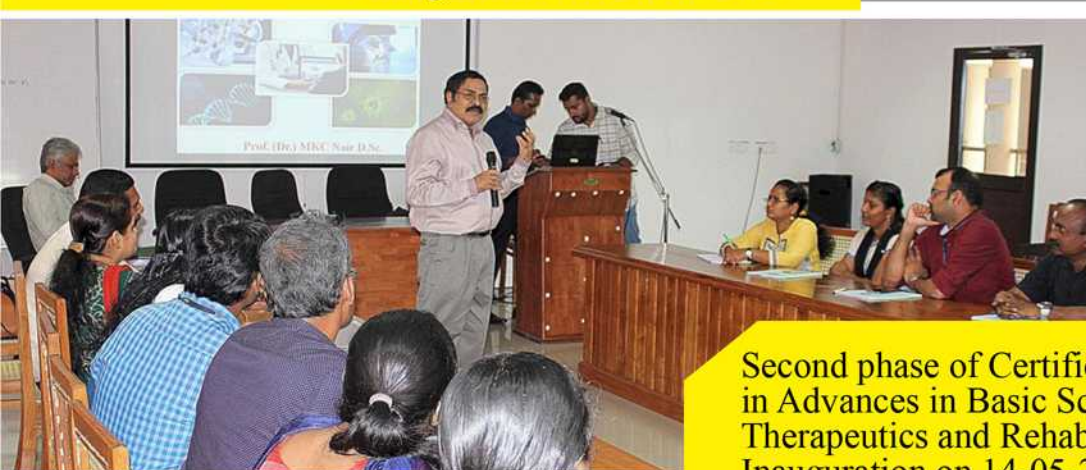
Second phase of Certificate Programme in Advances in Basic Sciences-Diagnostic, Therapeutics and Rehabilitation Technology. Inauguration on 14-05-2019