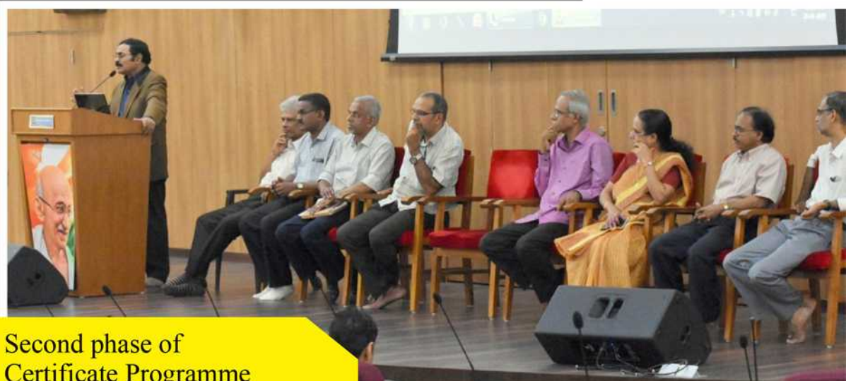
Second phase of Certificate Programme in Research Methodology. Inauguration on 26-04-2019