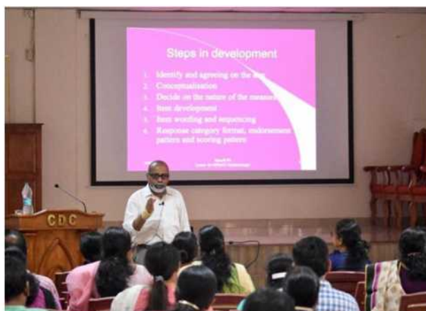
Research methodology workshop for PG students on 6th and 7th March 2019 at MCC, Thalasseri.