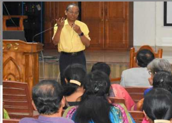
Two-day training programme on Biostatistics on 18 & 19 January 2019 at Child Development Centre, Thiruvananthapuram