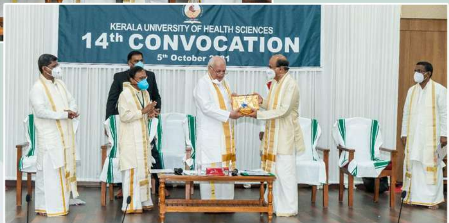
Hon'ble Vice Chancellor presents gift to Hon'ble Governor & Chancellor of the University