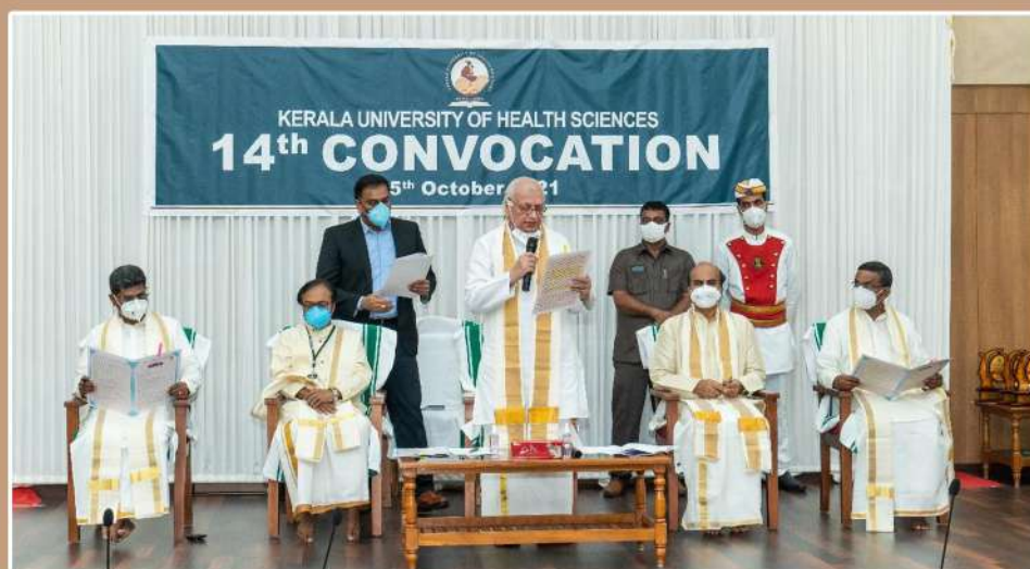
Hon'ble Governor Conferring degrees