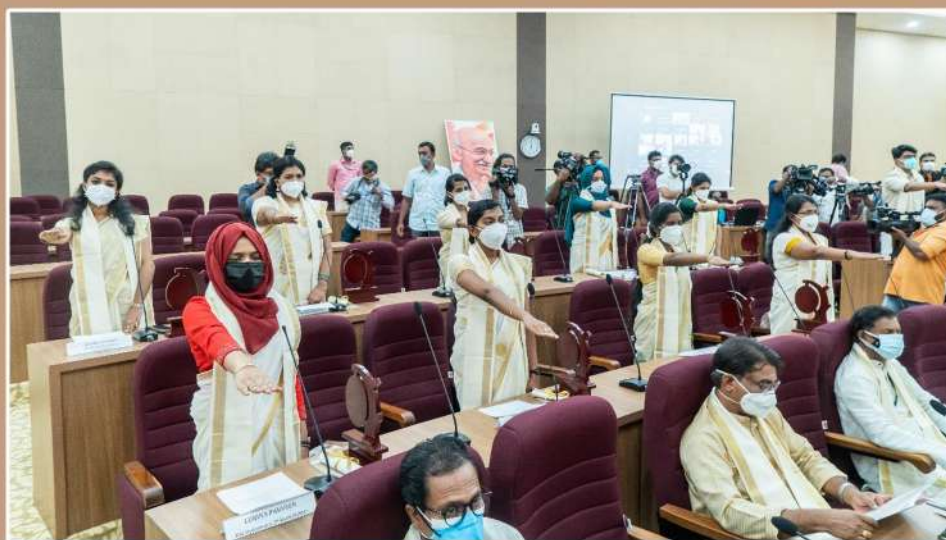
Declaration by the students against 'giving or taking dowry'

Doing away with hats and gowns, the university opted for traditional wear for its 14 th convocation ceremony for the first time. While female students were dressed in traditional saree, male students used 'jubba' and 'mundu' along with a 'veshti'.