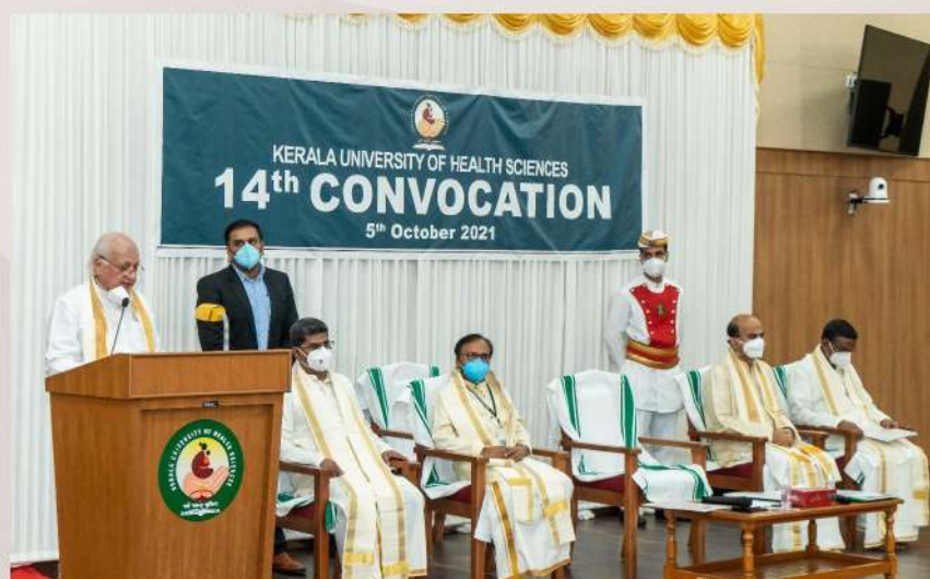
Hon'ble Governor Shri. Arif Muhammad Khan giving the presidential address

In his convocation address, the governor appealed for concentrating more on research in medical sciences in the backdrop of Covid 19. He congratulated the university for its campaign against dowry and reiterated the importance of improving interpersonal relationships among youth. 14,229 students were conferred with degrees at the ceremony.