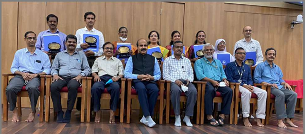
Best Teacher Award 2021 Winners with Vice Chancellor and other Statuary Officers of KUHS